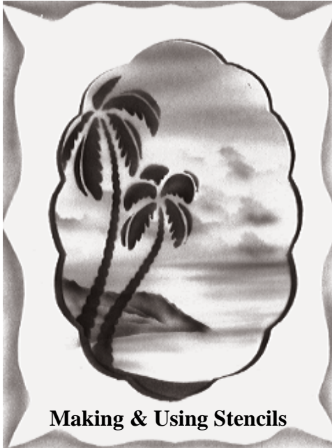
Making & Using Stencils