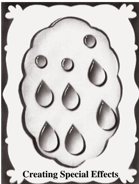
Creating Special Effects

ALL EQUIPMENT NEEDED is listed on a separate supply list.